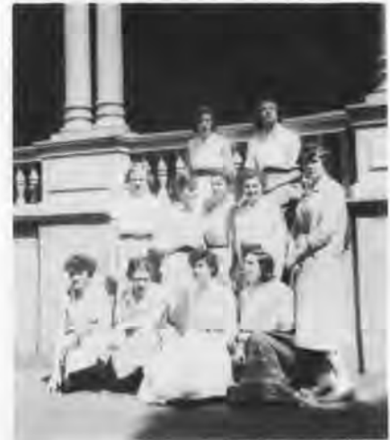
The class of '53 as seniors.