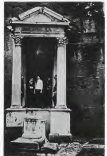
It Happened here in the Forum—The same PDS quintet posed for Mr. McCord's camera where a statue used to stand in a private altar in the Roman Forum.