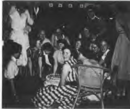
A birthday party for the class of '56.