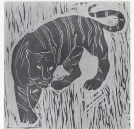
Michele Plante '78