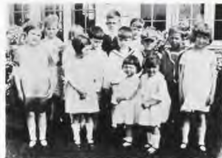
Future MFS and PCD alumni in the '30's. (See '37 class notes.)