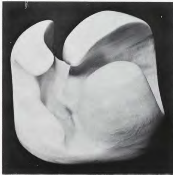
Sally Schluter '75