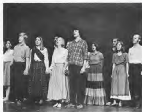
"Brigadoon" cast singing the title song.